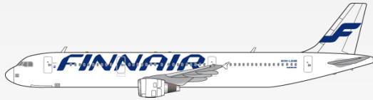
AIRBUS A321 – 11 a/c incl Sharklet