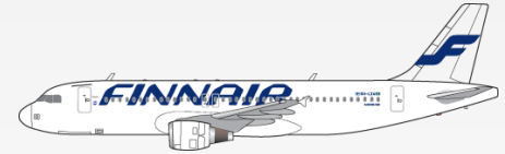
AIRBUS A319 – 9 a/c