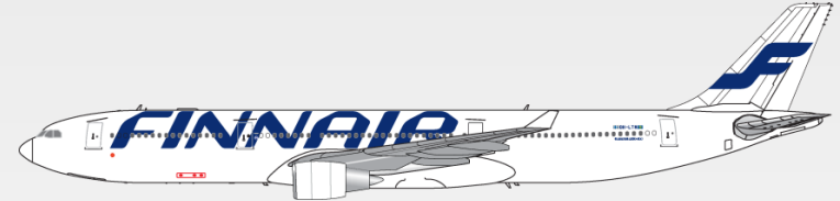
AIRBUS A330 – 8 a/c