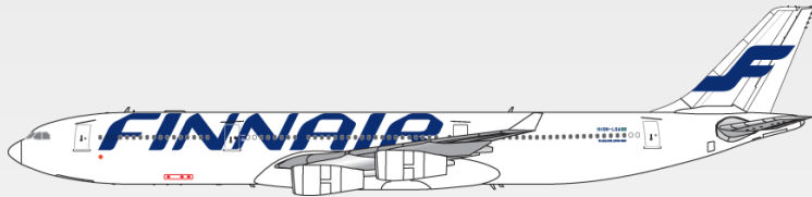
AIRBUS A340 – 7 a/c