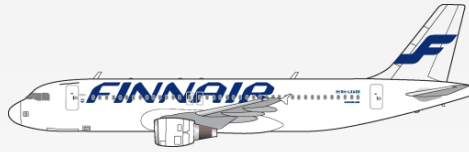
AIRBUS A320 – 10 a/c