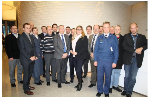
Attendees of military stakeholder meeting, Helsinki

February 2012 in Helsinki. States representatives were also present in the meeting.