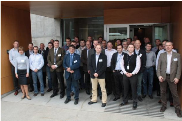
Attendees of projects kick off meeting at EANS, Tallinn